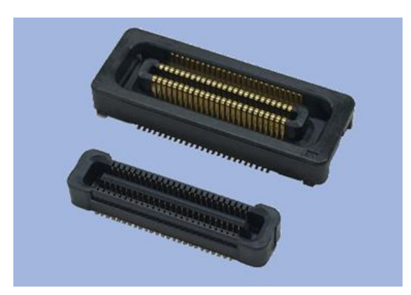
5655 Series Board-to-Board connectors feature a 4mm stacking height and 0.5mm-pitch

Kyoto/London, September 9<sup>th</sup>, 2019. Kyocera announced its new 5655 Series electronic Board-to-Board connectors optimized for high-speed data transmission, featuring a 0.5mm-pitch and a stacking height of just at 4mm — among the world's thinnest for this class of connector<sup>1</sup>. Samples are now available globally upon request, and Kyocera will exhibit the new connectors at <u>electronica India 2019</u>, an international trade fair for electronic components, systems and applications to be held from September 25 through 27 in Delhi, India (Hall 11, Booth #EG01).